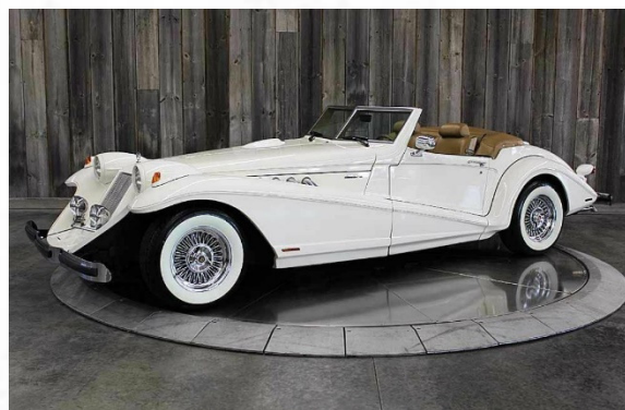
The 1994 Besasie Excalibur Baci auto.

Our thoughts and prayers go out to his entire family. He will surely be missed by all who knew him.