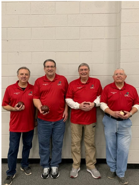
Spring Bocce League Tournament Winners